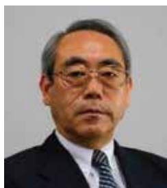
Prof. Masaaki Suzuki